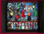
The Fabian Window, designed by George Bernard Shaw in 1910